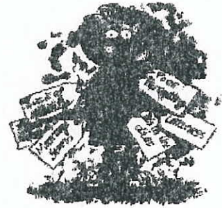
Illustration reproduced with the permission of Routledge Falmer, Aspergers and Autism , from Green & Case (1997) Understanding ADHD