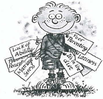
Illustration reproduce with the permission of Random House Australia and taken from Green & Chee (1997) Understanding ADHD

Diagnosis of ADD , ADHD , PDD , Aspergers or Autism warrants immediate referral to MedicAlert® to protect the interests and safety of the patient.